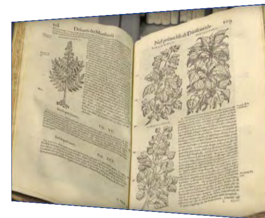
Special collections - Humanities Library